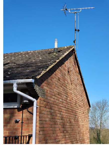
Roofing (Tiles and Cladding)