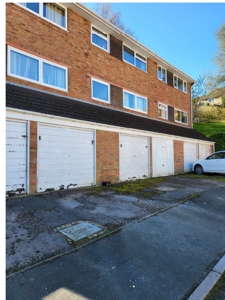
Car Park (Vehicle Parking)