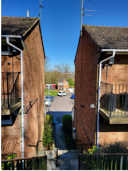
Exterior Structure (The Building)