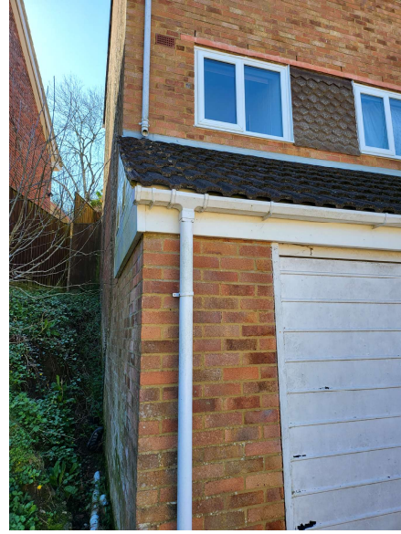
Guttering (Gutters and Fascia)